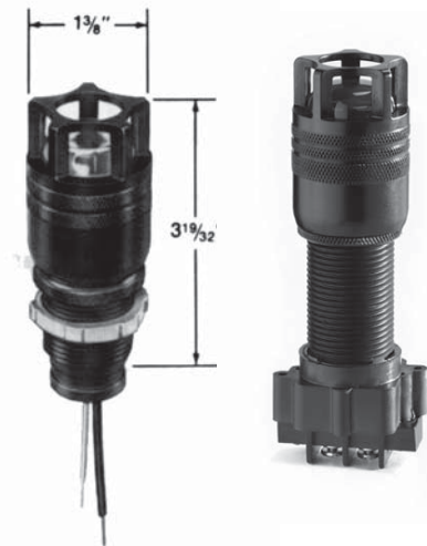
XLS Short Series (Surface Mount)